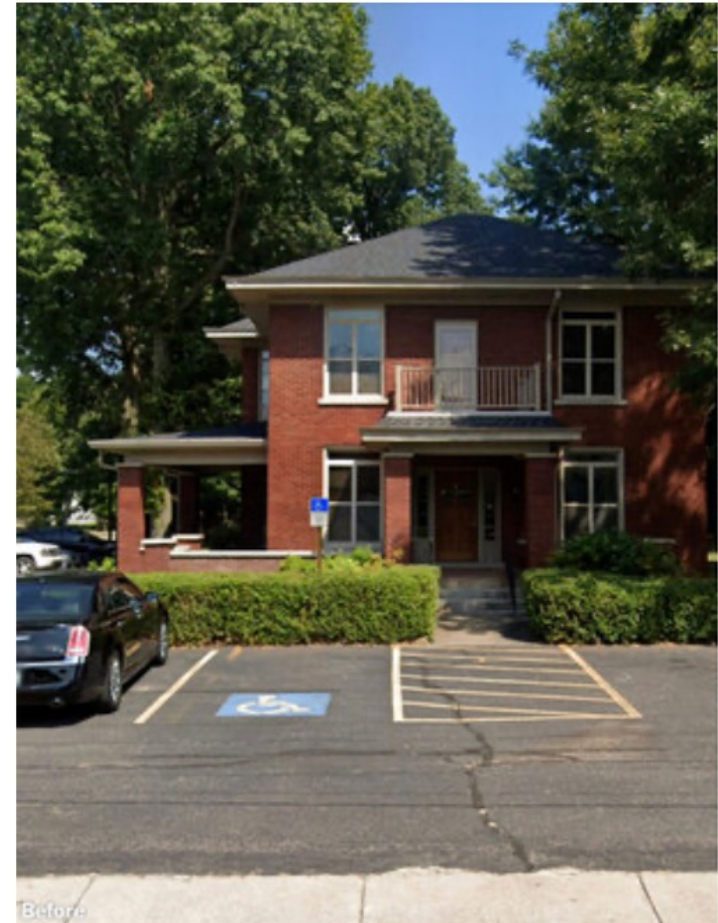
Before and after in Mayfield, Ky.