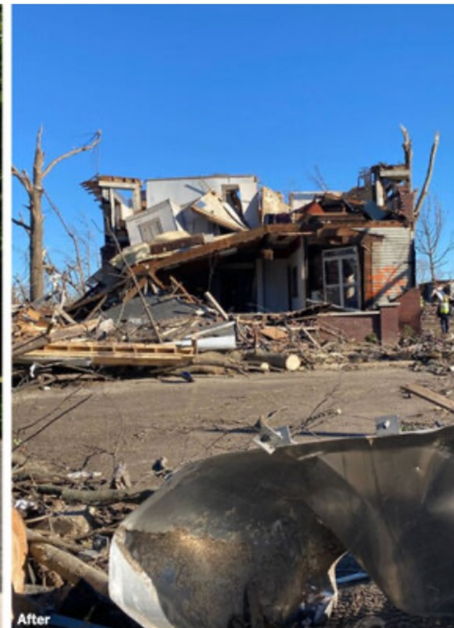
Before and after in Mayfield, Ky.