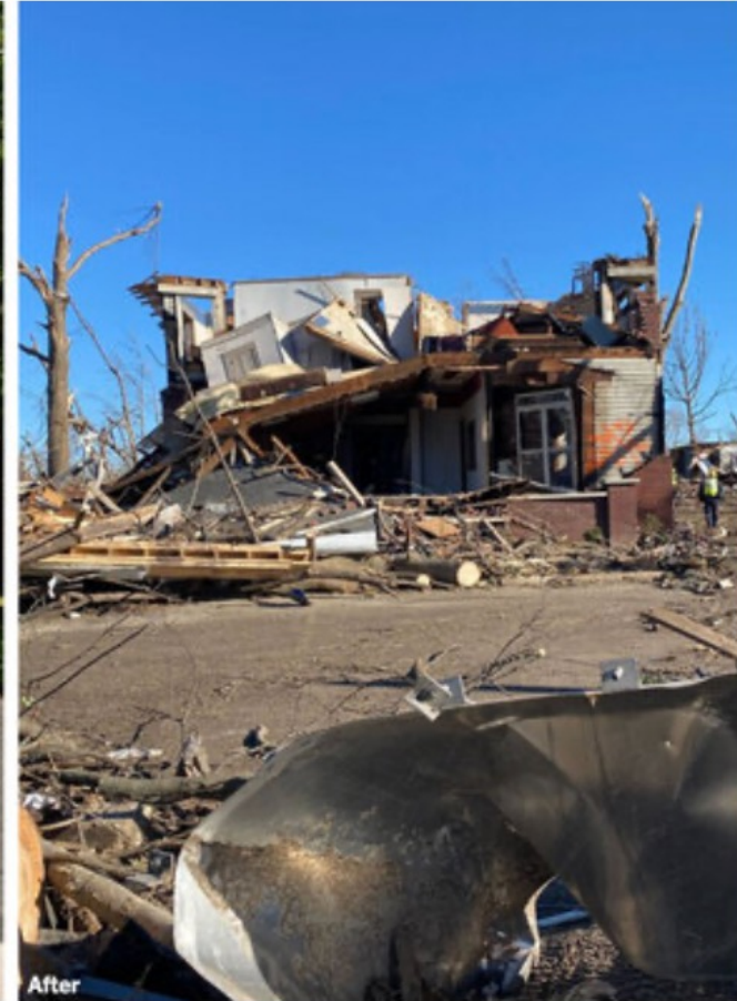
Before and after in Mayfield, Ky.